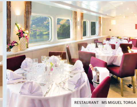
RESTAURANT MS MIGUEL TORGA