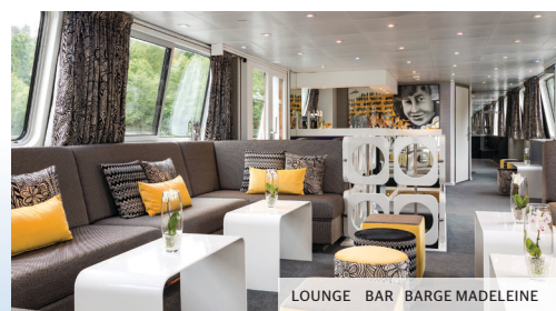
LOUNGE BAR BARGE MADELEINE