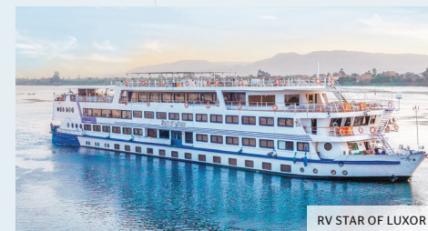
RV STAR OF LUXOR