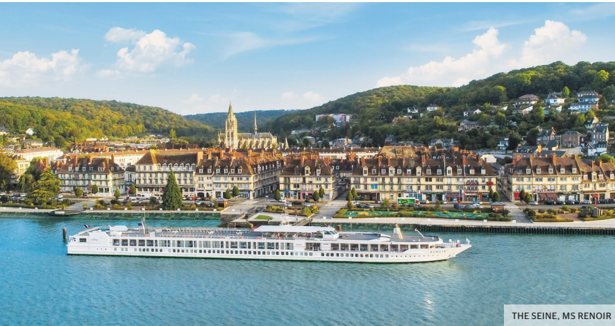
THE SEINE, MS RENOIR