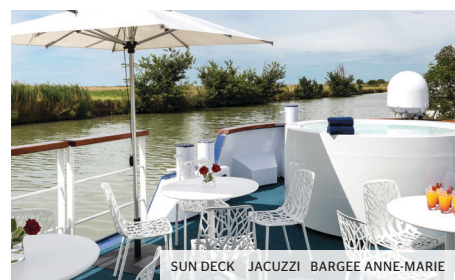
SUN DECK JACUZZI BARGE ANNE-MARIE