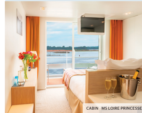
CABIN MS LOIRE PRINCESSE

Hotel and ship staff are at your service. Captains, pursers, entertainers, kitchen and dining room staff are all members of our crews. Experienced and English-French bilingual, they will give you their warmest welcome!