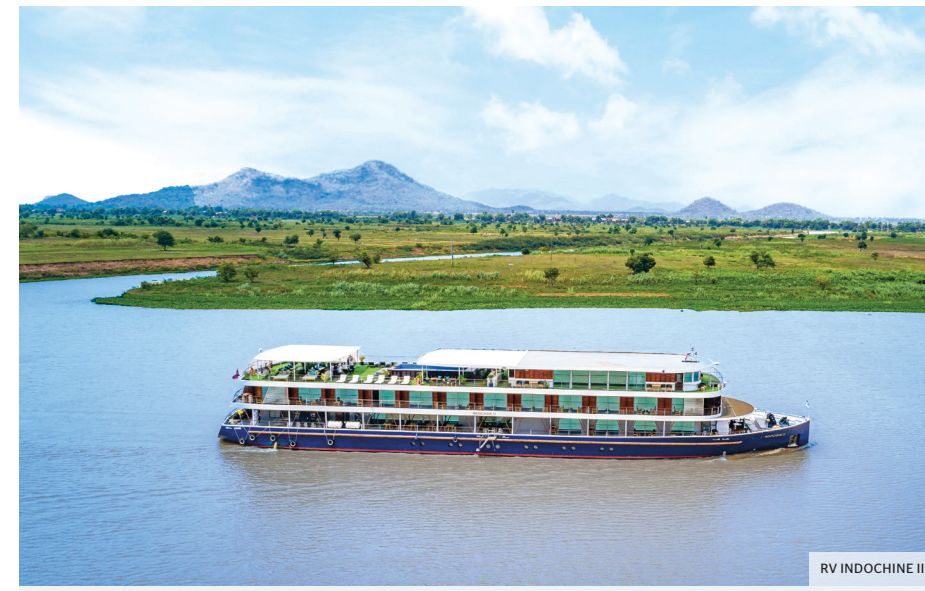
RV INDOCHINE II