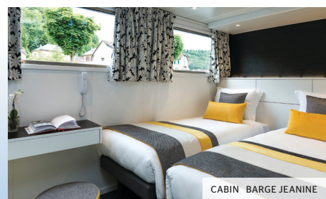
CABIN BARGE JEANINE