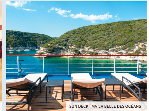
SUN DECK MV LA BELLE DES Océans