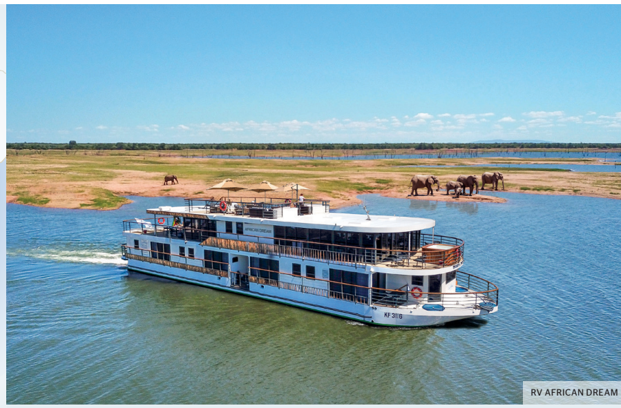
RV AFRICAN DREAM