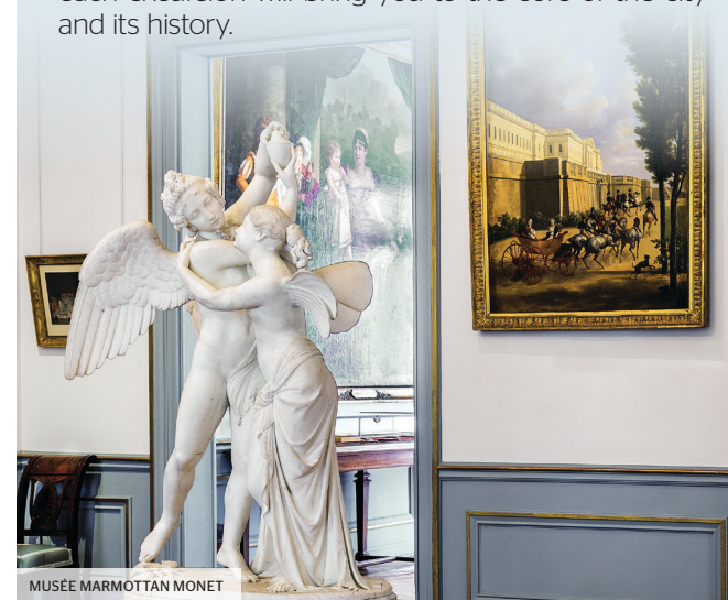
MUSÉE MARMOTTAN MONET

Discover the Rhône through an offbeat, seven-day cruise. See each city differently as you retrace the footsteps of the artists and celebrities who influenced their cultures. From Alphonse de Lamartine's Mâcon to Marcel Pagnol's Marseille, with side trips to Paul Bocuse's Lyon and Van Gogh's homestead in Arles, each excursion will bring you to the core of the city and its history.