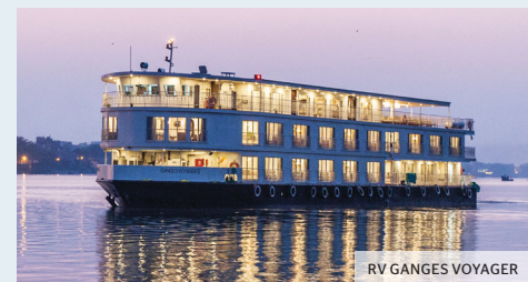
RV GANGES VOYAGER